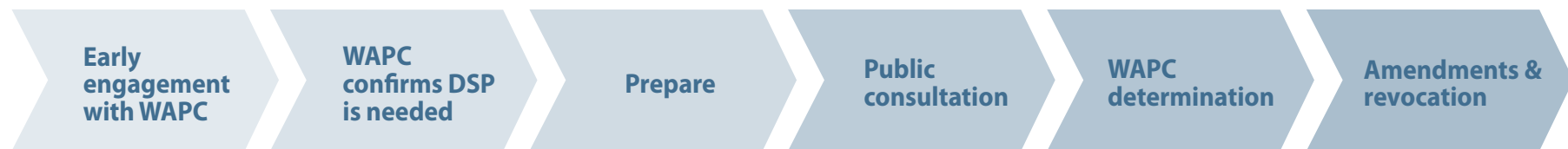
Figure 1: DSP process

The function of DSPs, while not explicitly referenced in the Planning and Development Act 2005 (the P&D Act), is aligned with WAPC's broad functions under section 14 of the P&D Act which include preparing plans for integrated and sustainable development and the coordinated provision of infrastructure.